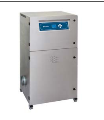
Optional Clean Air Cowl - 640002